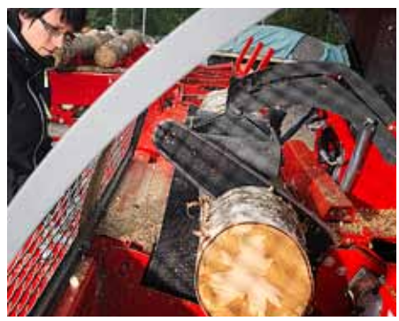
The wood is cut with a 20" hydraulic chain saw.

HakkiPilke Easy 50 (Firewood Factory) This superior, professional machine showcases the expertise and pioneering status of Maaselän Kone Oy as a developer and manufacturer of firewood processors. One cubic metre of firewood is produced with seven splitting strokes. Due to the automatically adjusted splitting power (4-30 t), the machine is an efficient and productive tool. HakkiPilke Easy 50 is an ergonomic workhorse for the professional. Input, cutting, and splitting are all controlled with just one joystick. Thanks to the solid bottom splitting groove and integrated dust remover, the working space remains clean and safe. The correctly designed perforation and colouring of the new safety cage allows optimum vision for easy work monitoring. The machine is light for its size and has an ideal weight distribution, meaning that it can be safely transported using the three-point lift of a medium-sized tractor. Thanks to its features, HakkiPilke Easy 50 is favoured by professionals producing firewood from the hardest wood species around the world.