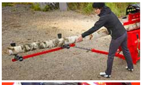
Lightness with a log hoist.

The HakkiPilke Expert 25, which is equipped with a chain saw, has been specifically designed for domestic use. The wood feeding functions have been simplified without compromising efficient wood processing. This solution enables the domestic user to achieve superior efficiency at an extremely competitive price. With the optional log hoisting device, handling even large trunks is easy.