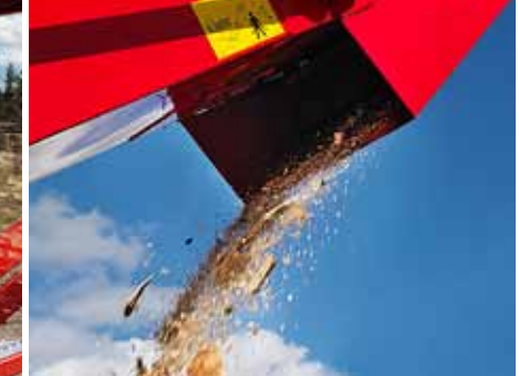
Innovative and efficient cleaning conveyor.