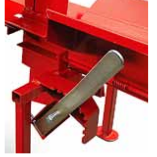
A speed valve is available as an accessory. Height adjustment for the splitting blade is easy using the control handle.