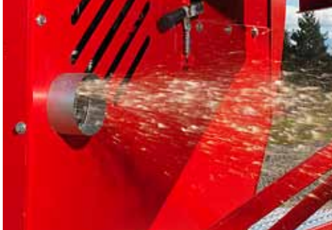
Integrated and effic ient dust removal.