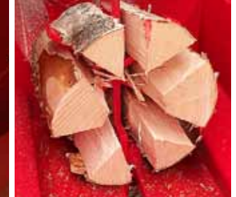
Hard metal blade A six piece splitter blade available as an accessory.